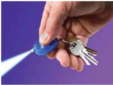
Luminance is the intensity of light that is leaving a surface and is measured in lumens.

The range of lux can vary from a full moon at 0.25 lux to sunlight at 100,000 lux. A comfortable lighting level for an office environment on the surface of a desk is about 500 lux. For most tasks, there is no additional benefit for lighting levels over 1,500 lux. Mighty Bright has established a pre-determined threshold for personal lights that assumes a light level down to 10 lux will be useful for most people. At this level of illumination text can be easily read and objects can be viewed with clarity.