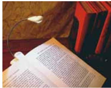
Illuminance is the intensity of light that is falling on a surface and is measured in lux.